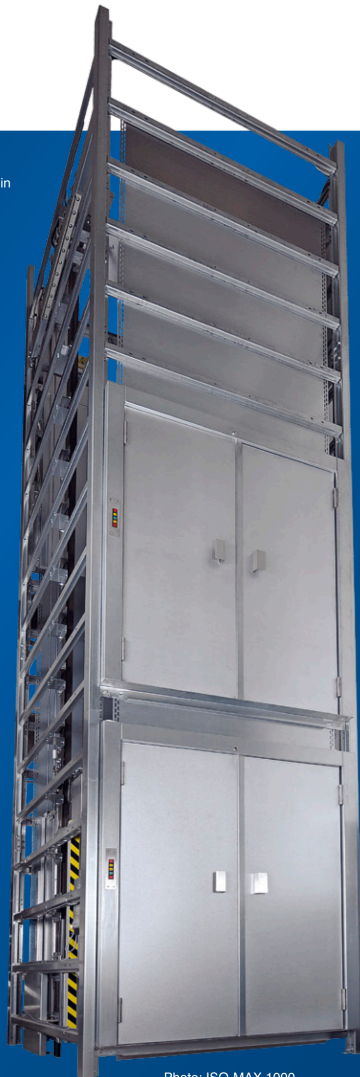
Photo: ISO-MAX 1000

Doku.-Nr. D-19-305E 09/2013 Layout: vielbauch.de